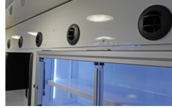
Upgraded AC Performance: 20% cooling improvement with recirculation technology and 8-speed control