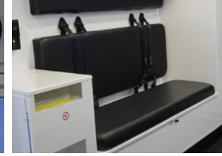
Wider Squad Bench: Improved comfort with 6" increased width