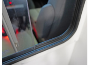
Improved Bulkhead Talk-Through: Double sealing for rattle-free performance