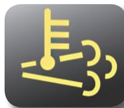
Hot Exhaust Light