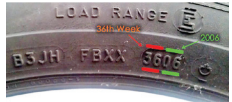
Right: Image showing how to determine age of tires.

As always, the service team at GLICK Fire Equipment is available to help with any questions you may have or to help schedule service. Need us to come to you? No problem! Our mobile service technicians offer the same excellent repair and maintenance service.